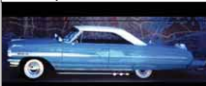
15. Brian Dubecky 64 Gal