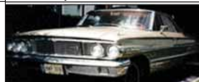
24. Tom Butler 64 XL project