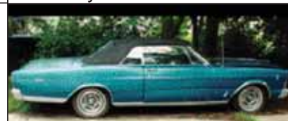
29. Pete Angell 66 Convrt