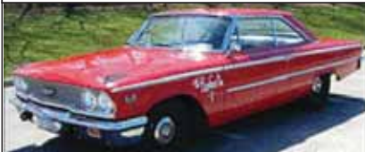
7. Brian Gerken 63 1/2 R-Code