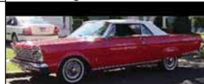
21. Frank Beyrodt 65 XL Convrt