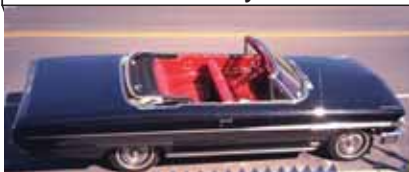
16. Nancy Brogden 64 Convrt 390