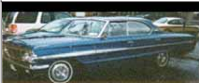
4. Syd Jensen 64 Gal