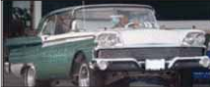
2. Bill Carberry 59 Gal