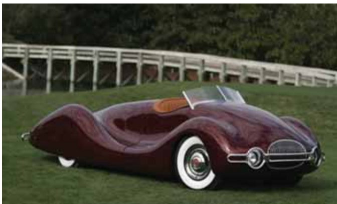
1948 Buick Streamliner