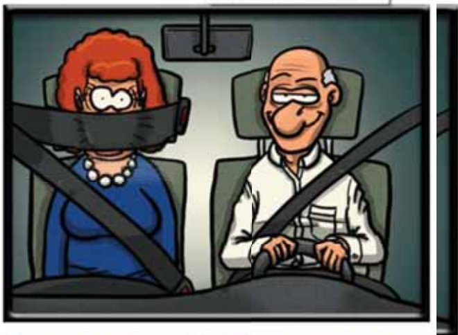
This can really save lives and lower blood pressure by 40%