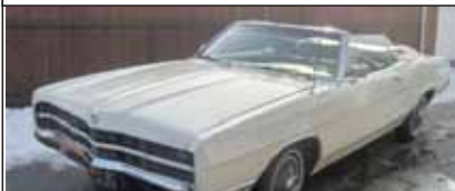
11. Gary Posch 69 Convrt XL