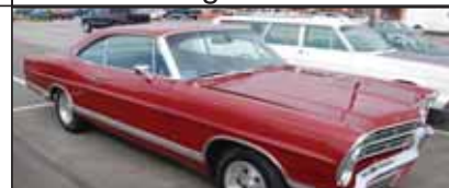
27. Jeff Tucker 67 Gal